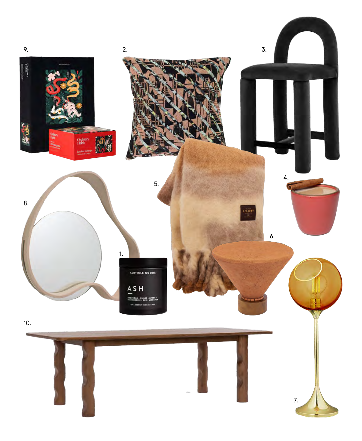
1. Ash Candle. With scent notes of birchwood, cinder, and myrrh, the Particle Goods Ash Candle is the key to bringing more warmth and earthiness into your home during the colder months. 2. Malaika Floor Pillow. Invite more coziness into your space with this gorgeous patterned pillow by K-apostrophe. It's the perfect size for a floor pillow, as well as for your couch. 3. Temi Counter & Bar Chair. Sun at 6 extended their Temi chair line into bar and counterstool options. We love the comfort, casual, and cozy feeling you get from the unique aesthetic. 4. The Kulhad. East Fork describes kulhads as handleless cup forms that originated centuries ago in the Indus Valley. These unique, limited edition cups are perfect for filling with your favorite seasonal hot beverages. 5. Tie-Dye Throw. Stay cozy through the cooler months with this gorgeous Ezcaray tie-dye throw. It is expertly crafted from a sumptuous mohair and wool blend to ensure warmth and plush comfort. 6. UDO Stool [Ekaabo Collection]. This one-of-a-kind stool uniquely marries utility with design. Use it as a makeshift coffee table that brings serenity and warmth into your space. 7. Ballroom Table Lamp. We are so excited about the new Marie Burgos lighting collection. The sleek bulbous shape is both sophisticated and unique. The amber color creates warmth in any space. 8. Mar Wall Mirror. Virginia Sin's new wall mirror collection is beyond stunning. The free-flowing shape of the Mar Wall Mirror is formed by hand. A 12" round mirror acts as a reflecting pool in this organic form that appears to float on the surface of the wall. 9. Snakes in the Garden Puzzle. Bring a little whimsy into your winter days at home with this gorgeous puzzle by Josefina Schargorodsky. 10. Wave Table. Sun at 6 created the new, design-forward Wave Table, which has a silhouette that speaks for itself. It was designed with the sense of touch in mind and is meant for long, thoughtful gatherings.